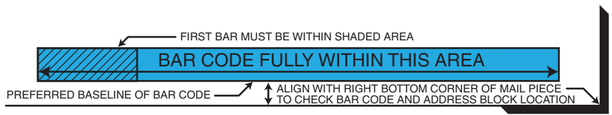
Bottom Edge of Envelope

Also available in standard window 1" x 4". Position from left, 1"; from bottom, \frac{3}{4} ".